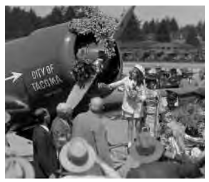
The christening. Not too hard, Clasina—remember, it's only spruce and canvas!

been built to increase take-off speed. As he hit the level ground at the bottom of the ramp a spray of gasoline covered the windshield from the fuel tanks that were expanding in the morning