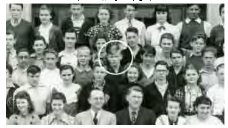
with choice plants from Cy (circled) —Clover Park Junior High School 9th graders, 1937