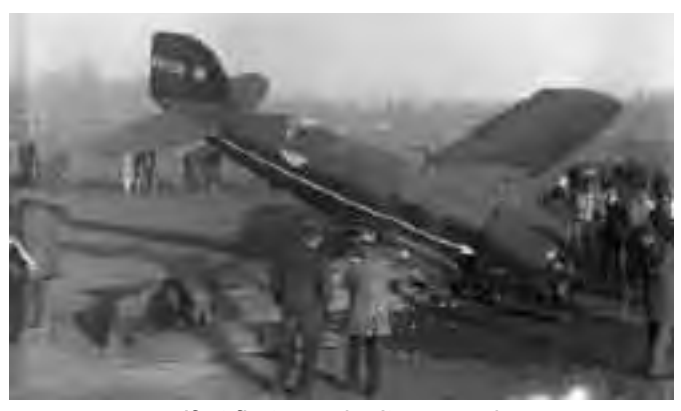
If at first you don't succeed... Aftermath of Bromley's first attempt.